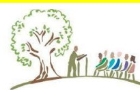
Outdoor Worship Service

Monday-Thursday from 9:00am to 1:00pm Friday-9:00am to Noon